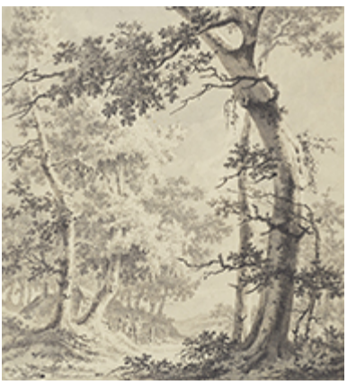
Wooded Landscape (detail), about 1780–90, Paulus van Liender. Pen and gray ink and wash over black chalk. The J. Paul Getty Museum