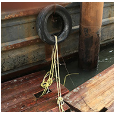
Lines (detail), Zoe Leonard, 2020. Courtesy the artist, Galerie Capitain, Cologne and Hauser & Wirth, New York

Register in advance for this free online event